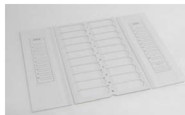
Carton Slide Map