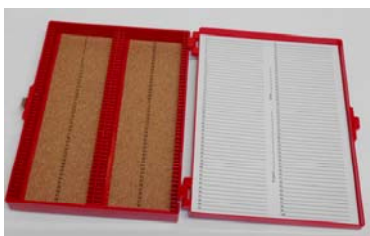
Slide box, big